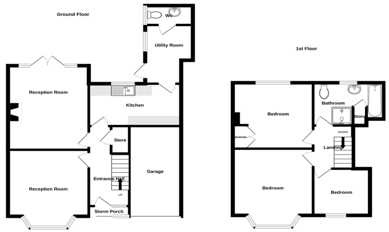
Briery Road, Halesowen, B63 1at

Offices at: KINGSWINFORM HALESOWEN STOURBRIDGE BRIERLEY HILL SEDGLEY